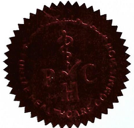
Chief Executive Officer